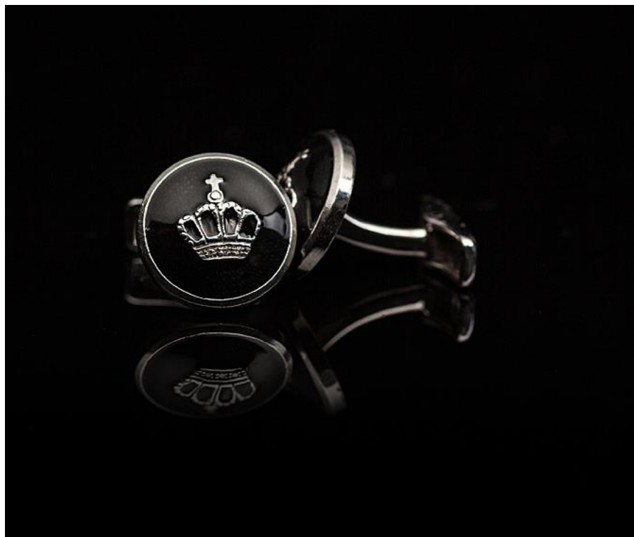
Item 57509BLK Crown Enamel Silver Cufflinks Black