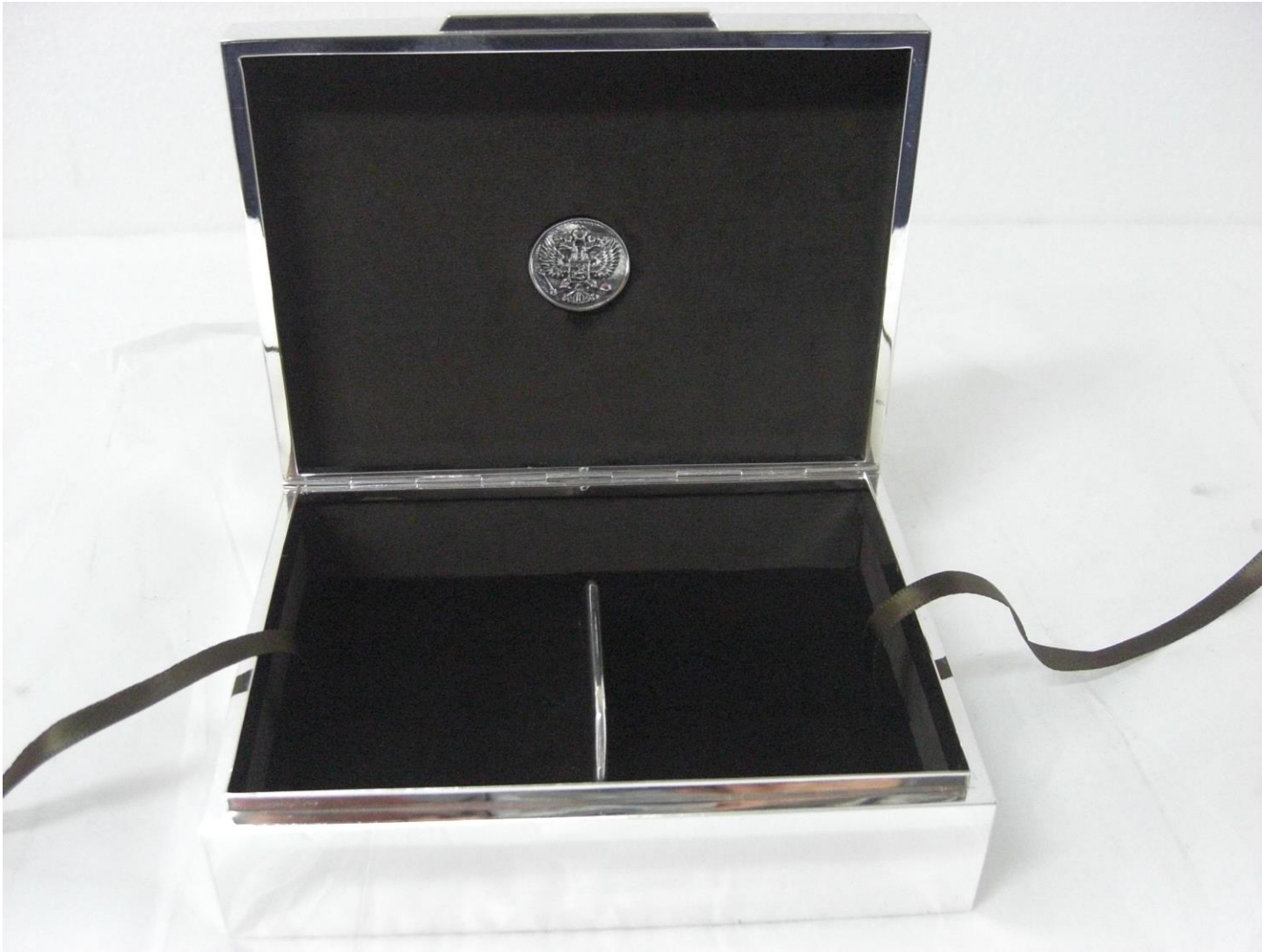
Item 271612 Romanov Plated Desk Box