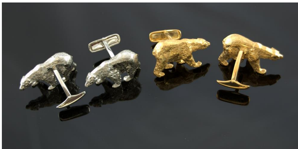
Item 570530 Polar Bear Sterling Silver Cufflinks with Diamonds Available in gilt 24 K item 570530G