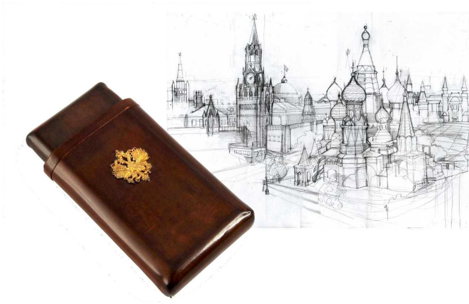
Item 681166 Double-Headed Eagle Cigar Holder